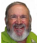
Last month's Dine-Out was at the Cattleman's restaurant.