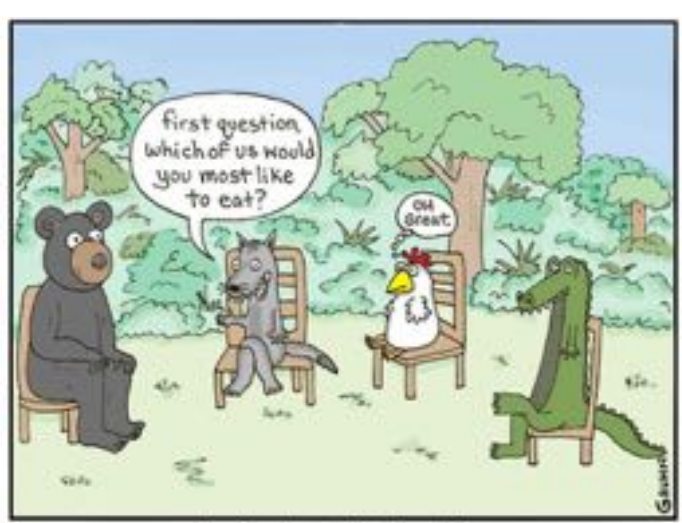
Ice breakers in the wild