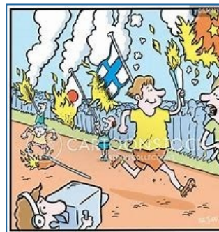
"The Olympic torch is certainly making a blazing entrance into the stadium!"

It's time for the Olympics. Although I may not understand France's opening controversial ceremony, I do recognize the narrative. Most times the theme for openings are for the visual extravagant effect, that is usually related to the spirit of the Olympic games. But anytime you mix social issues