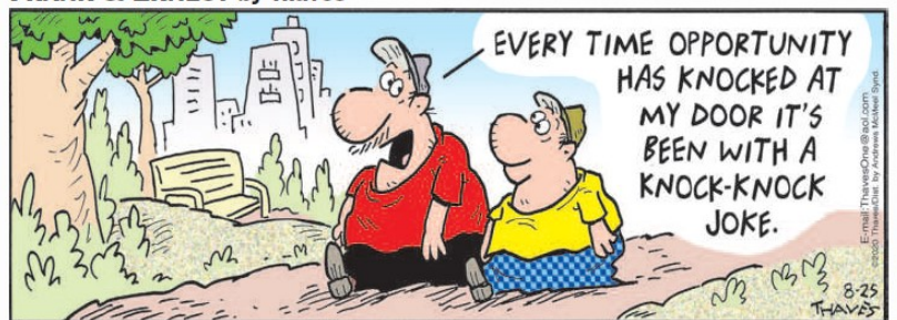
FRANK & ERNEST by Thaves