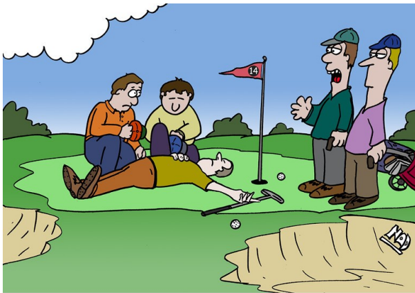
"Do you mind if we play through...?"

However, nothing , not even war, could stop the British from playing golf as this list of rules indicates. Here, in outer London, England, in Richmond, Surrey, we have searched the history archives and found this sign which was placed around the Richmond Golf course warning players of war related problems: