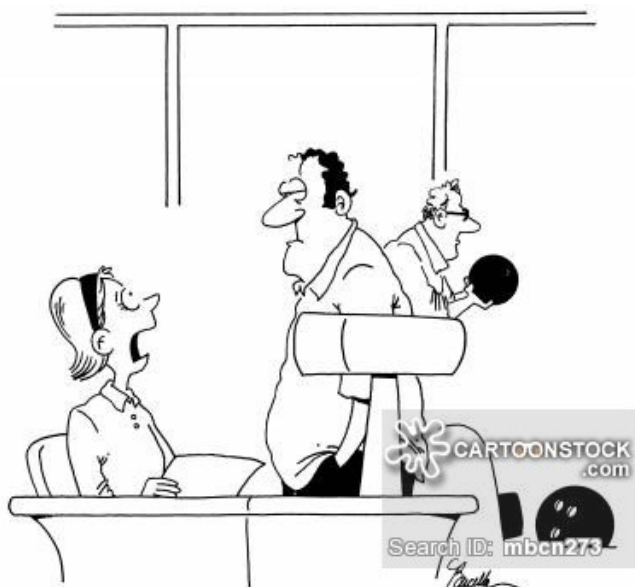
"Lost your ball in the rough? Larry, this is bowling!"