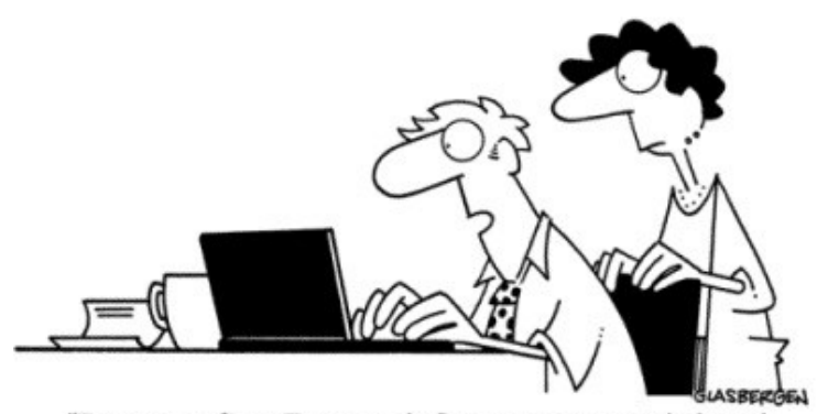
"I gave my first Treasurer's Report at our condo board meeting tonight but I only pretended to know what I was talking about. Fortunately, the board was only pretending to listen."