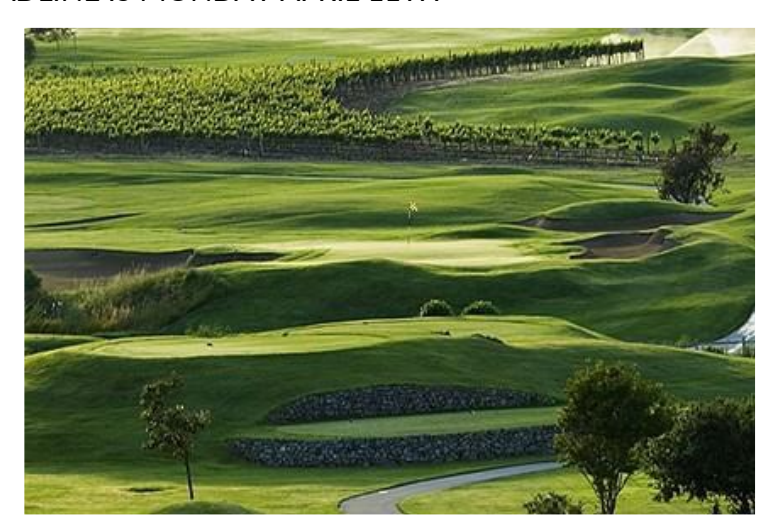
Chardonnay Golf Course, Napa

ADDITIONAL INFORMATION ABOUT THIS TOURNAMENT AND APPLICATION CAN BE FOUND ON THE SIR STATE GOLF WEBSITE AT "WWW.SIRGOLF.ORG"