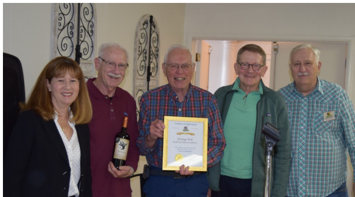
April's presenters on "The Vial of Life" project.